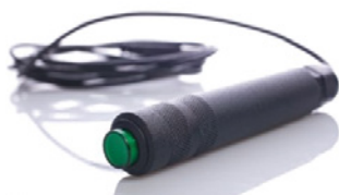
Patient Response Unit