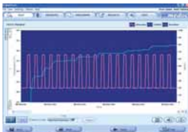
Windup test protocol