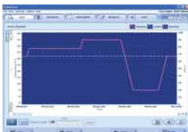
Ramp & Hold protocol